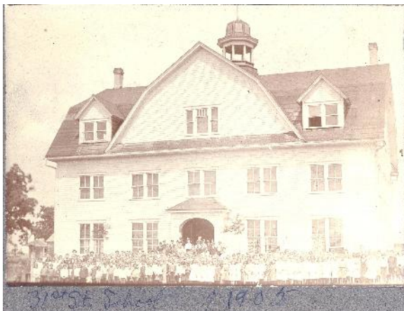
31 st Street School 1905