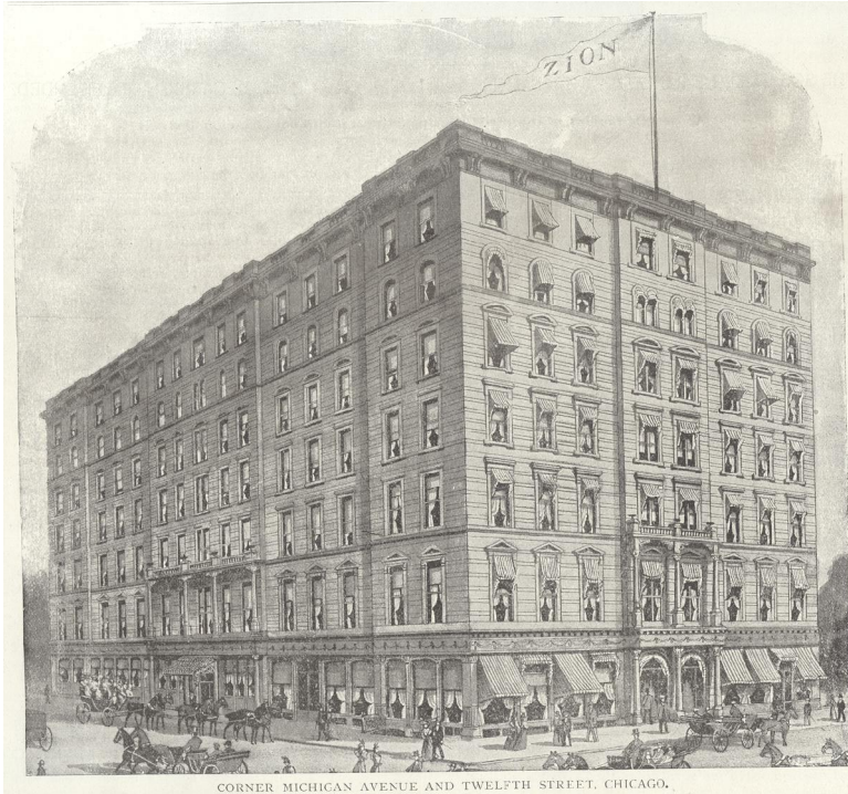
CORNER MICHIGAN AVENUE AND TWELFTH STREET, CHICAGO.

IS A CHRISTIAN, TEMPERANCE AND DIVINE HEALING HOME WITH ALL THE COMFORTS OF A FIRST-CLASS HOTEL.