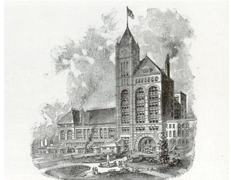
Terminal Station Illinois Central Railroad===one block from Zion Home.

Fronts directly on Michigan Avenue, the finest Boulevard Driveway in the world. Is but one Block distant from the new Terminal Station of the Illinois Central Railway.